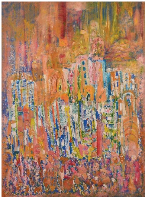
Festival of Joy / 2002 / 200 x 150 cm / Oil on Canvas

they embody the future of our world, while Passion (1991) represents the artist's idea of waiting, of lingering in a state of transcended emotion.