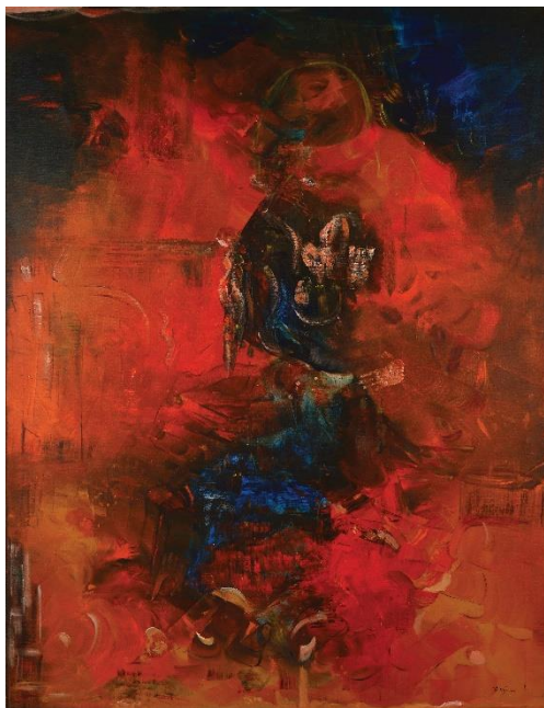
Passion / 1991 / 280 x 200 cm / Oil on Canvas

Settling in Switzerland in 1972, after a few formative years as a self-made artist in Paris in the late sixties, Lagrouni has progressively created a unique visual language that evolved greatly over the years. By maintaining a truly Moroccan painterly identity while expanding on themes linked to the searching of one's identity when living abroad - a recurring subject in the artistic creations of the diasporas - Lagrouni also allowed his talents as a pianist and percussionist to penetrate the canvas and orchestrate movements and compositions. Jazz music in particular can be seen as a major influence through many of his signature brushstrokes.