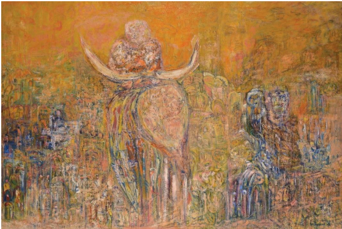
Hinde / 1991 / 200 x 300 cm / Oil on Canvas