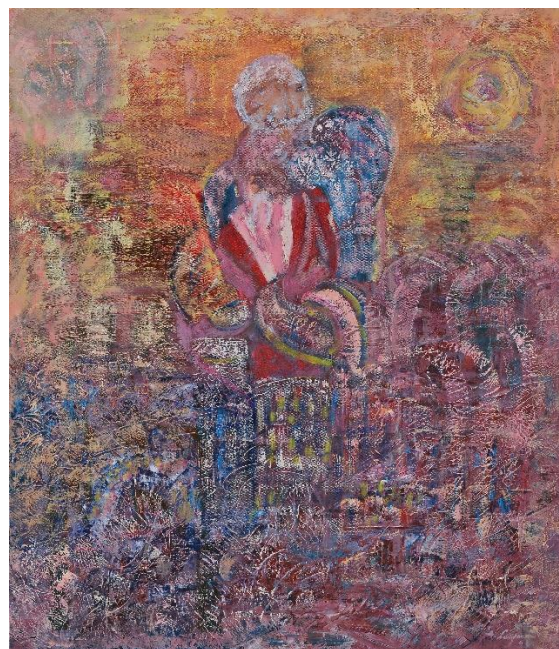
Root / 2001 / 80 x 60 cm / Oil on Canvas

Exhibitions of Ali Lagrouni's works truly started in the French speaking region of Switzerland in the second part of the 1980s (mostly in Geneva, Lausanne and Montreux), culminating with an exhibition at the United Nations in Geneva in 1988.