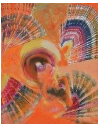
African Dance - 50 x 40 - Oil on Canvas - 2012