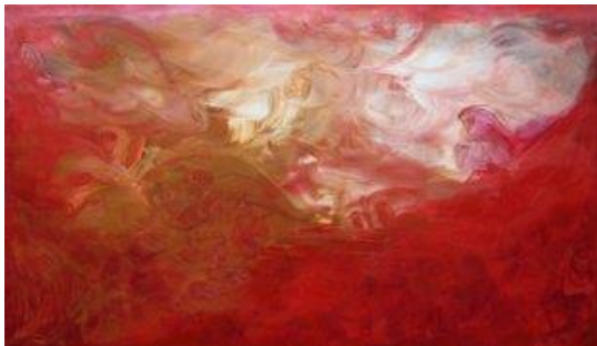
Angel of Love - 120 x 160 - Oil on Canvas - 2015