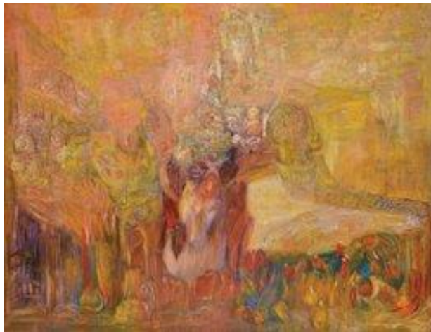
Welcoming - 200 x 300 - Oil on Canvas - 1991