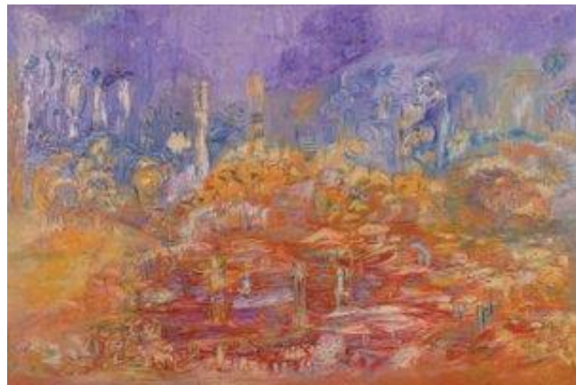
Renaissance - 130 x 194 - Oil on Canvas - 2012