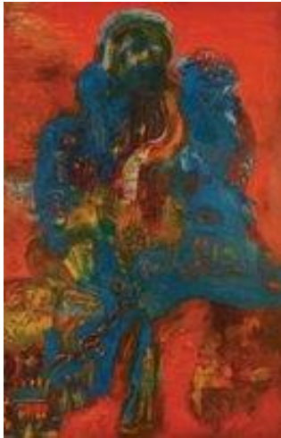
Touareg - 250 x 160 - Oil on Canvas - 2005