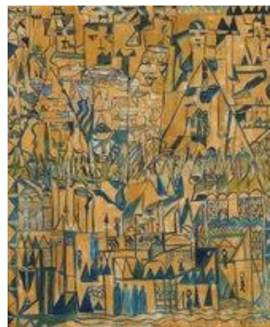
Egyptology - 120 x 100 - Oil on Canvas - 1996