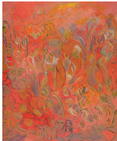
Body, Soul & Spirit - 120 x 100 - Oil on Canvas - 2011