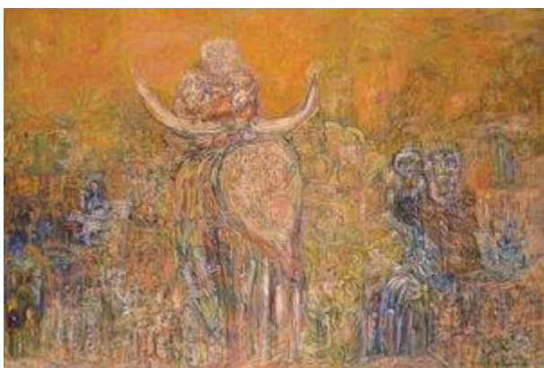
Hinde - 200 x 300 - Oil on Canvas - 1991

Feel free to click on the paintings below to see them in HD in our gallery.