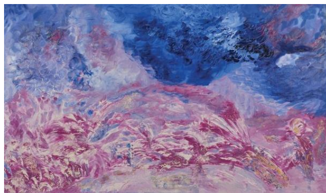
Complementarity - 130 x 194 - Oil on Canvas - 2012