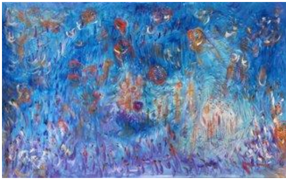
Oceanic - 90 x 128 - Oil on Canvas - 2015