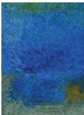
Depth - 80 x 59 - Oil on Canvas - 2005