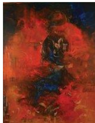
Passion - 280 x 200 - Oil on Canvas - 1991