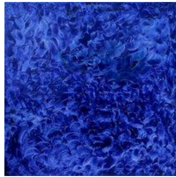
Blue Note - 120 x 120 - Oil on Canvas - 2015