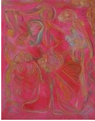
Duality - 100 x 80 - Oil on Canvas - 2012