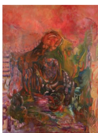
Supreme Protection - 260 x 200 - Oil on Canvas - 2005