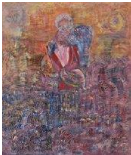
Root - 80 x 60 - Oil on Canvas - 2001