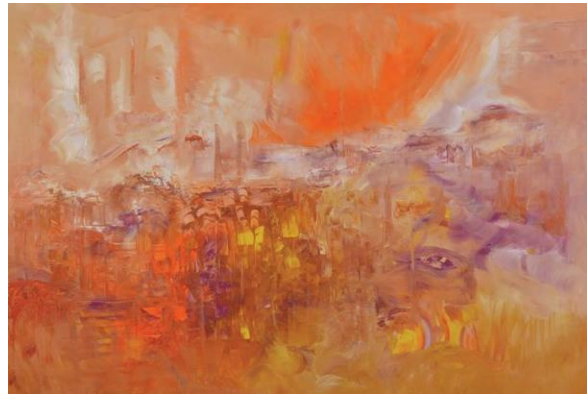
Light of Morocco - 195 x 129 - Oil on Canvas - 2012