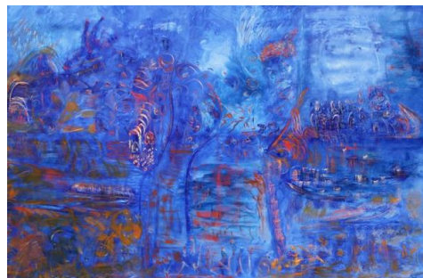
The Great Blue - 200 x 300 - Oil on Canvas - 2017