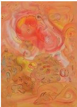
Composition - 107 x 80 - Oil on Canvas - 2011