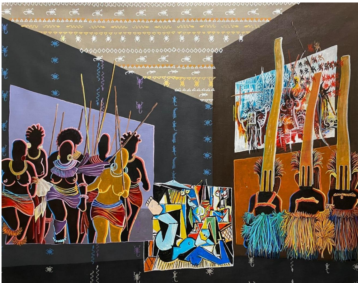
The Damsels of Swaziland-Dogon (2023)