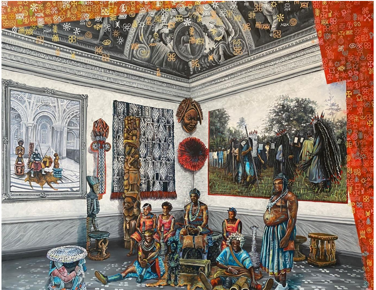
Roi-Fö, La'akam (2023)