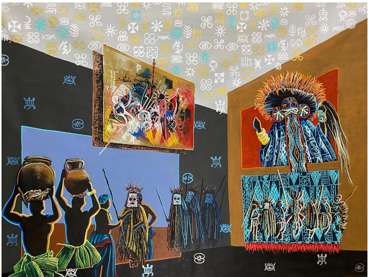
Secret Society (2023)